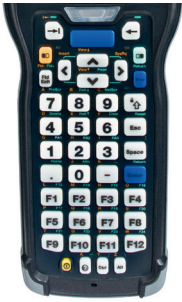
NUMERIC WITH FUNCTION KEYS

Both keypad options feature hard keycaps with wear-resistant, laser-etched legends.